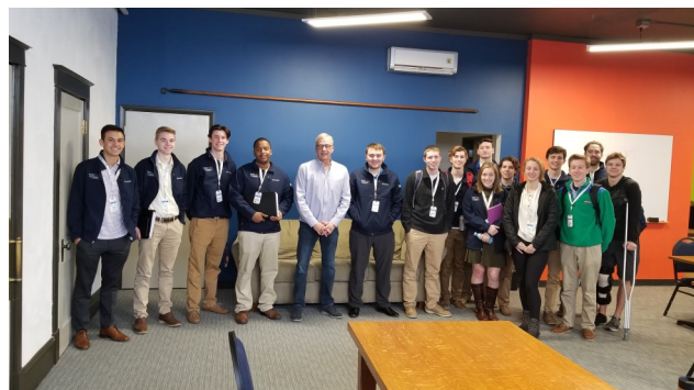
Artigem Replacement Services